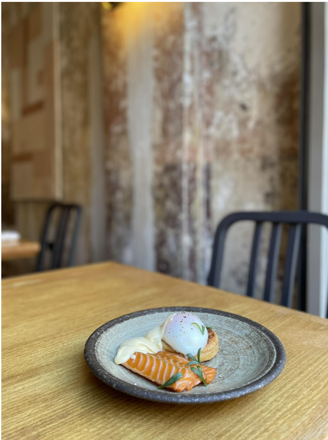
Images: Slow cooked eggs, smoked trout, hollandaise